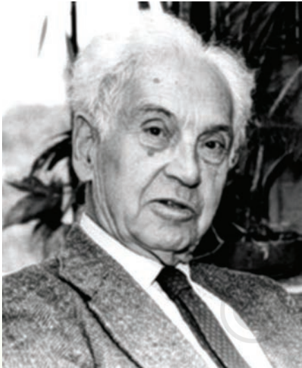
Ernst Mayr (1904 – 2004)

Born on 5 July 1904, in Kempten, Germany, ERNST MAYR, the Harvard University evolutionary biologist who has been called 'The Darwin of the 20 th century', was one of the 100 greatest scientists of all time. Mayr joined Harvard's Faculty of Arts and Sciences in 1953 and retired in 1975, assuming the title Alexander Agassiz Professor of Zoology Emeritus . Throughout his nearly 80-year career, his research spanned ornithology, taxonomy, zoogeography, evolution, systematics, and the history and philosophy of biology. He almost single-handedly made the origin of species diversity the central question of evolutionary biology that it is today. He also pioneered the currently accepted definition of a biological species. Mayr was awarded the three prizes widely regarded as the triple crown of biology: the Balzan Prize in 1983, the International Prize for Biology in 1994, and the Crafoord Prize in 1999. Mayr died at the age of 100 in the year 2004.